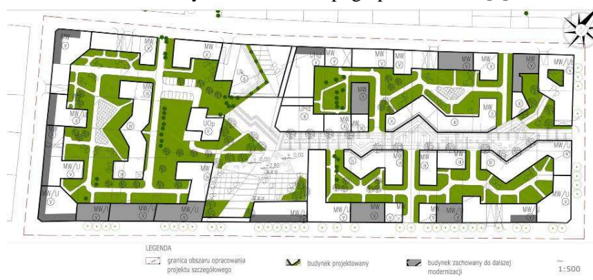
Fig. 3 An example of the concept of modernization of the building quarter of "New Praga", general area of building: approx. 80 thousand square metres, 950 flats, building intensity - 2 Source [9]

very affluent, create a specific, unique community of "former Praga", which still retains its individuality of moral and topographic nature. 6 [7].