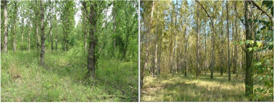
Fig. 2. Protective forest shaping at site B and Z1

The study was conducted in the area of protective forest where the dominant species were Populus robusta L. and Betula pendula Rorth. The sanitary zone outlook has been shown in Fig. 2.