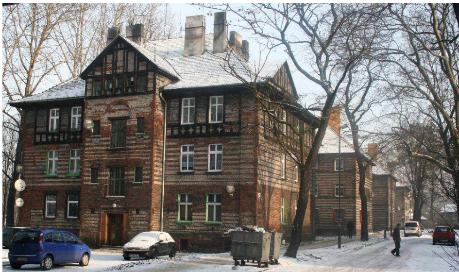
Fig. 1. Residential buildings in the settlement of Zandka in Zabrze