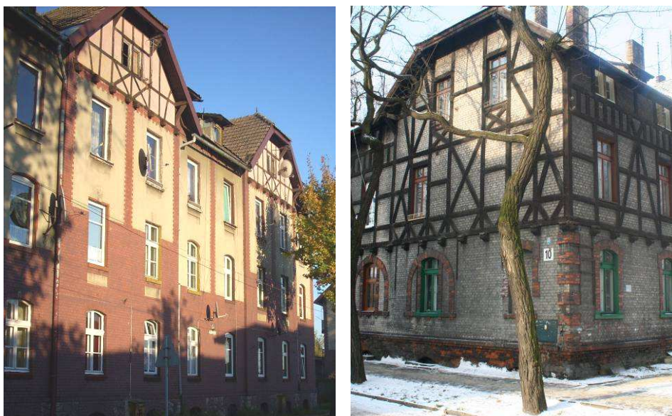
Fig. 2. Residential buildings in the railwaymen settlement in Pyskowice (left) and Zandka in Zabrze (right)

These objects were created during the periods of different, from today's, regulations on thermal insulation or lack of them. Their current state of the