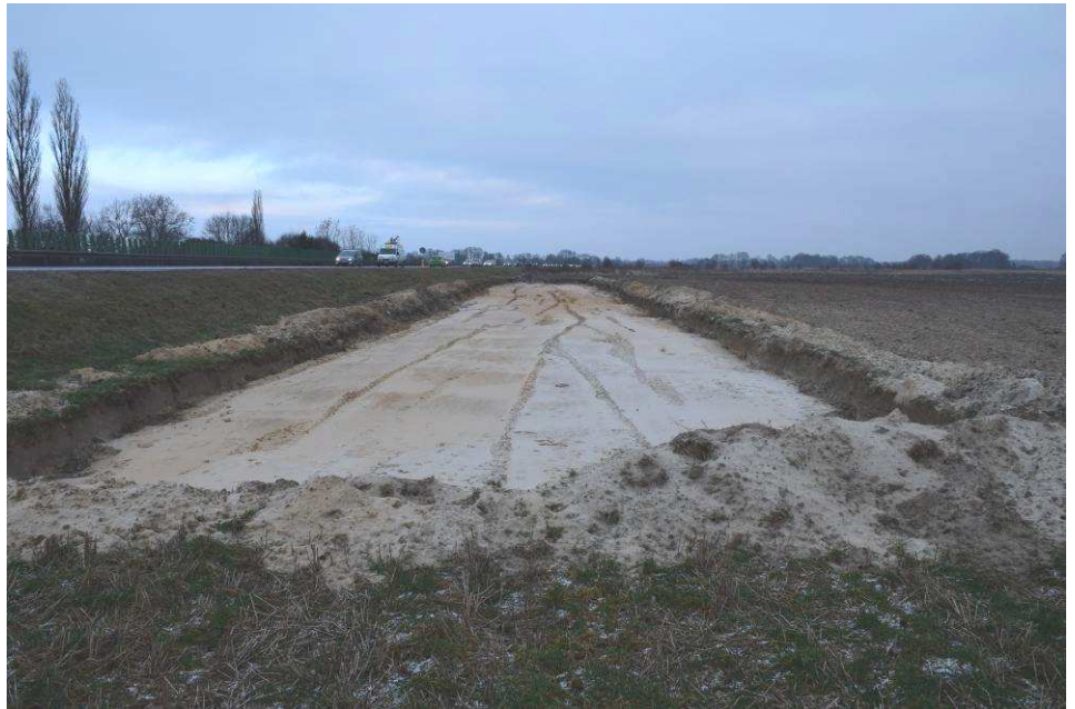
Fig. 3. View of the archaeological site at the stage of preparing the road construction

Excavation works, depending on their scope, are carried out during the construction period (just prior to the essential building works) or in advance. The importance, in this case, also has the location of the investment. The example of conducting archaeological works well in advance and rescue research during the implementation of the essential investments are shown in the photographs (fig. 3 and 4).