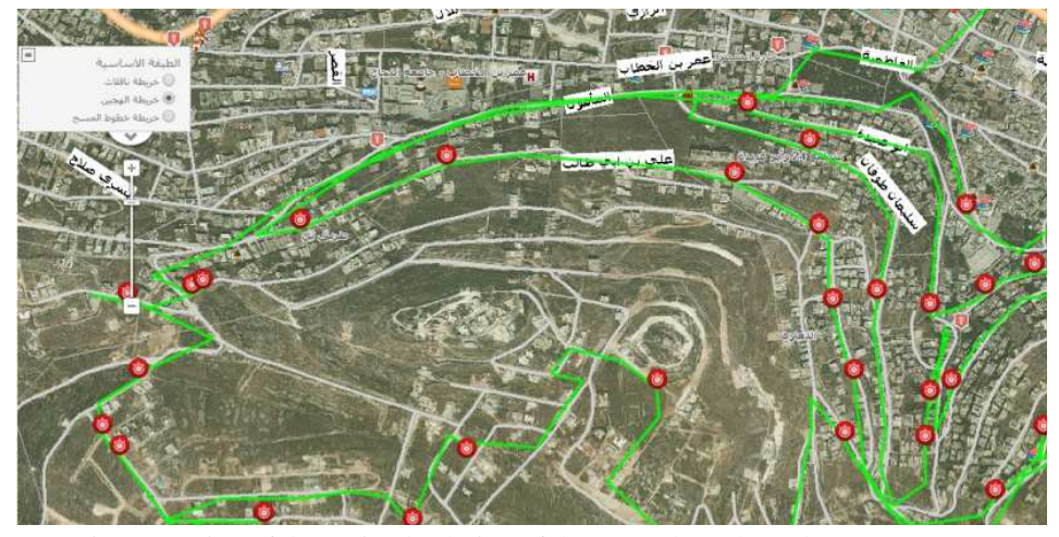
Fig. 2. Portion of the optimal solution of the GA, where the red spots represent dumpsters

Regarding time saving in SW collection, from the collected truck GPS data, each truck moves an average of 45 Km/hour, then the saving in the driving time would be about 4.6 hours per truck. That is about 2 hours 19 minutes per truck