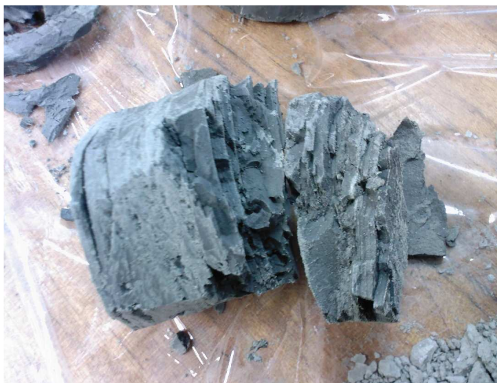
Fig. 1. A soil sample with a visible altered structure