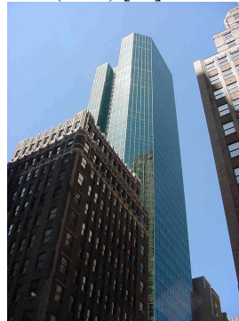
b) Tower 49 in New York (1985) [20]