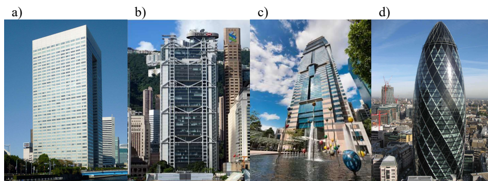
Fig. 2. First Intelligent Buildings in Asia and Europe. a) Toshiba HQ in Tokyo, Japan (1984) [19], b) Bank HSBC in Hong Kong (Norman Foster, 1985) [13], c) Capital Tower in Singapore (RSP Architects, Planners & Engineers, 2000) [14], d) 30 St. Mary Axe in London, UK (Foster + Partners, 2003) [12]

One of the building features is a highly intelligent parking management system that calculates in real time, where drivers are guided via wall-mounted displays and as a result - a driver saves time and fuel consumption. Among other technologies of this building should be noted exhaust fans that are activated in the car parks when the carbon monoxide sensors register more than 1,000 parts per million; escalators that are slowed down if not in use; 35 passenger elevators are equipped with dual LCD panels, which provide news in real time; since 2008 the Capital Tower has been using NeWater for many of its non-domestic purposes: irrigation systems for landscape areas, air-conditioning and fire protection. The NeWater is being delivered to these systems via a separate piping system approved by the authorities [22].