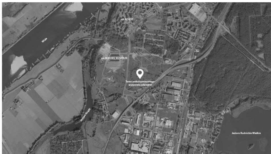
Fig. 1. Satellite view with the location of the landfill marked. Own elaboration based on [5]