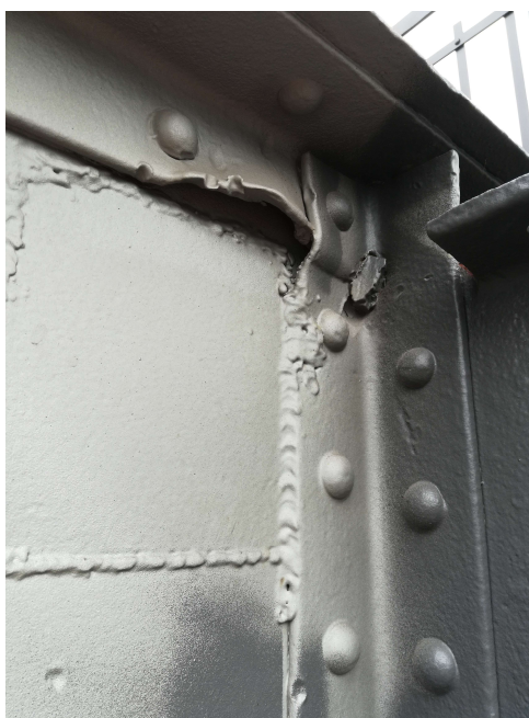
Photo 5. Visible damage resulting from armed conflicts

The aim of the monument protection office is to preserve the cultural heritage of our country in the best possible form and condition. In the case of buildings so important for the region, cooperation with preservation services is extremely important as such activities increase attention during the performance of works, increase costs, and generate the use of other technologies and methods. Moreover, it is difficult to use the object. In this case, in addition to its aesthetic value, the bridge must meet the standards and conditions enabling contemporary vehicular and pedestrian traffic. In connection with the modernization plans on the Oder River, it was important that the activities related to the preservation protection did not collide with the strategic goals of the Country, aimed at improving the navigability of the Oder Waterway. Despite technological advances and modernization of the country's infrastructure, it is extremely important to care for the cultural heritage and preserve the relics of the past for future generations, so that despite the passage of time, we can still admire the craftsmanship of the past centuries.