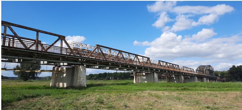
Photo 2. Bridge in Cigacice. South-east view

The Monbart Bridge is a 384-meter crossing over the Oder River, along the district road no. 1187F, and connects Zielona Góra with Cigacice. It is a 10-span structure with a static diagram of a simply-supported beam (Photo 2).