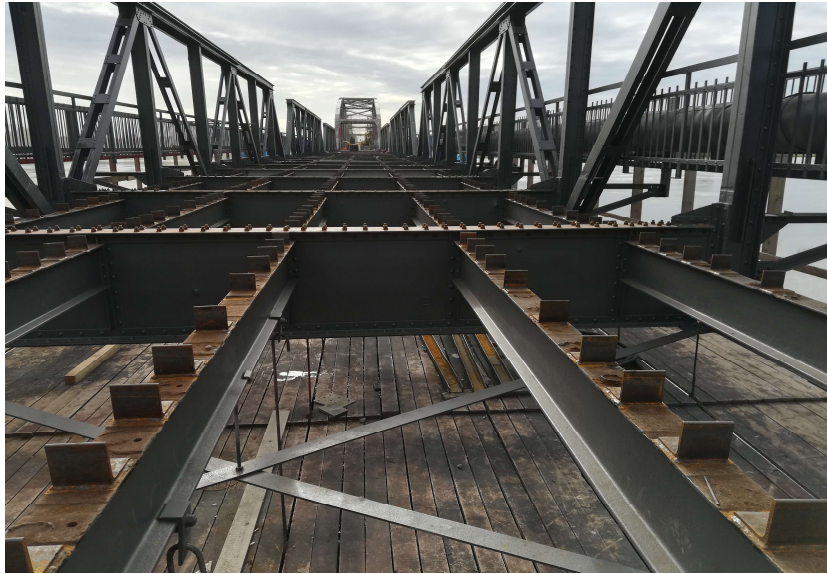
Photo 4. Replacement of the bridge slab

It is also planned to repair the portal gate and protect it with a cover plate to prevent water accumulation inside the bolts. Abutments and pillars only needed to be cleaned, to fill their cavities and apply new coatings. The shafts of the sliding bearings were replaced (the remaining bearing elements were subjected to preservation and securing works), and new planks were made. Additionally, it is planned to replace the surface of the pedestrian route and install concomitant devices (including streetlamps).