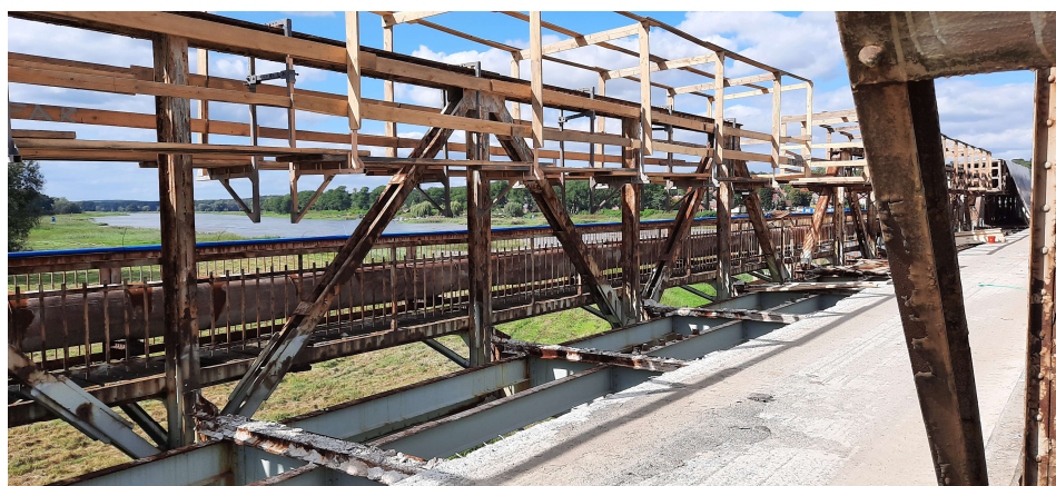
Photo 3. Renovation of the bridge steel structure

The structure of the bridge did not require excessive interference and only a few elements were replaced. Most of the steel load-bearing elements only had surface corrosion (Photo 3). After cleaning, anti-corrosion coatings were applied and, in agreement with the Lubuski Provincial Conservator of Monuments, the entire structure was covered with a dark shade of gray paint.